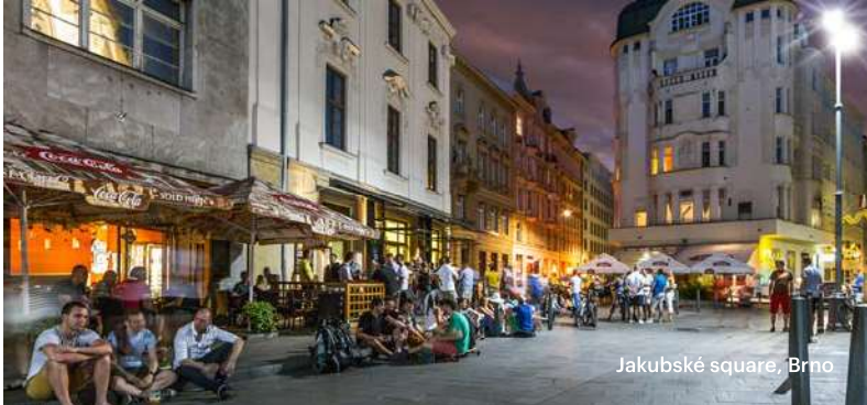
Jakubské square, Brno