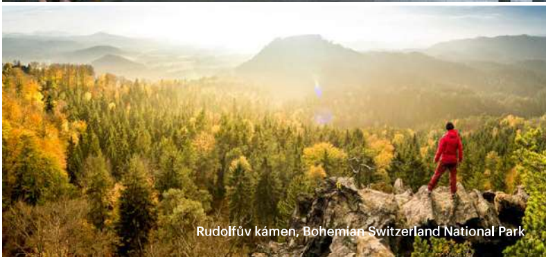
Rudolfův kámen, Bohemian Switzerland National Park