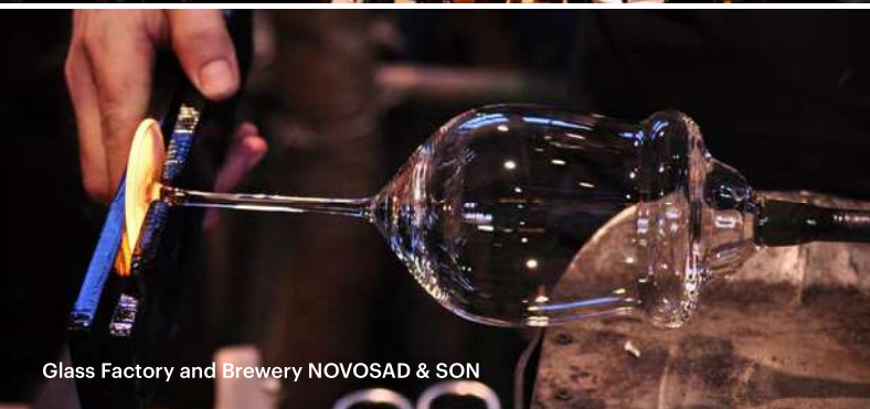
Glass Factory and Brewery NOVOSAD & SON