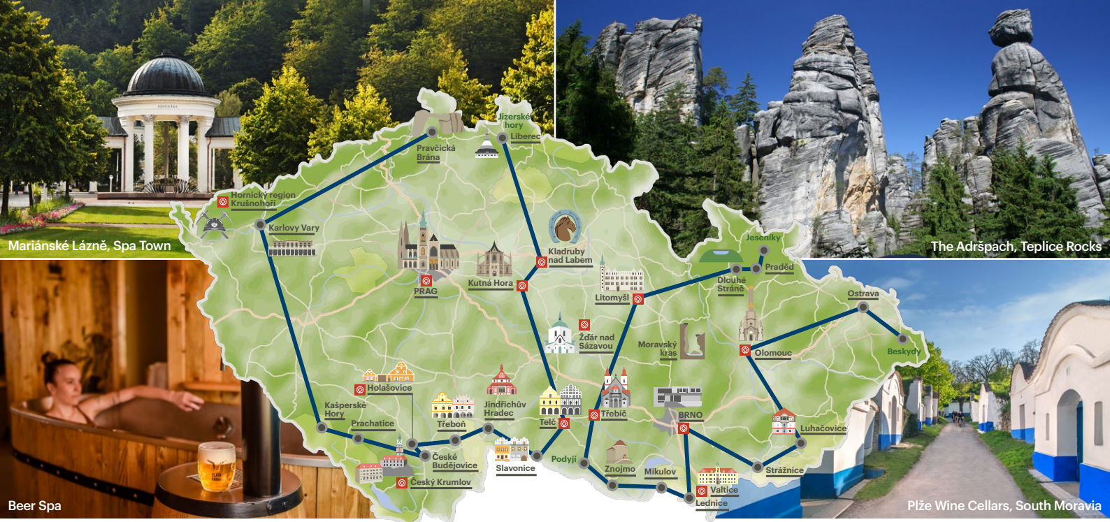
Mariánské Lázně, Spa Town