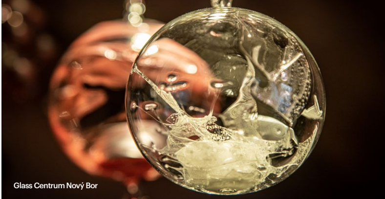
Glass Centrum Nový Bor