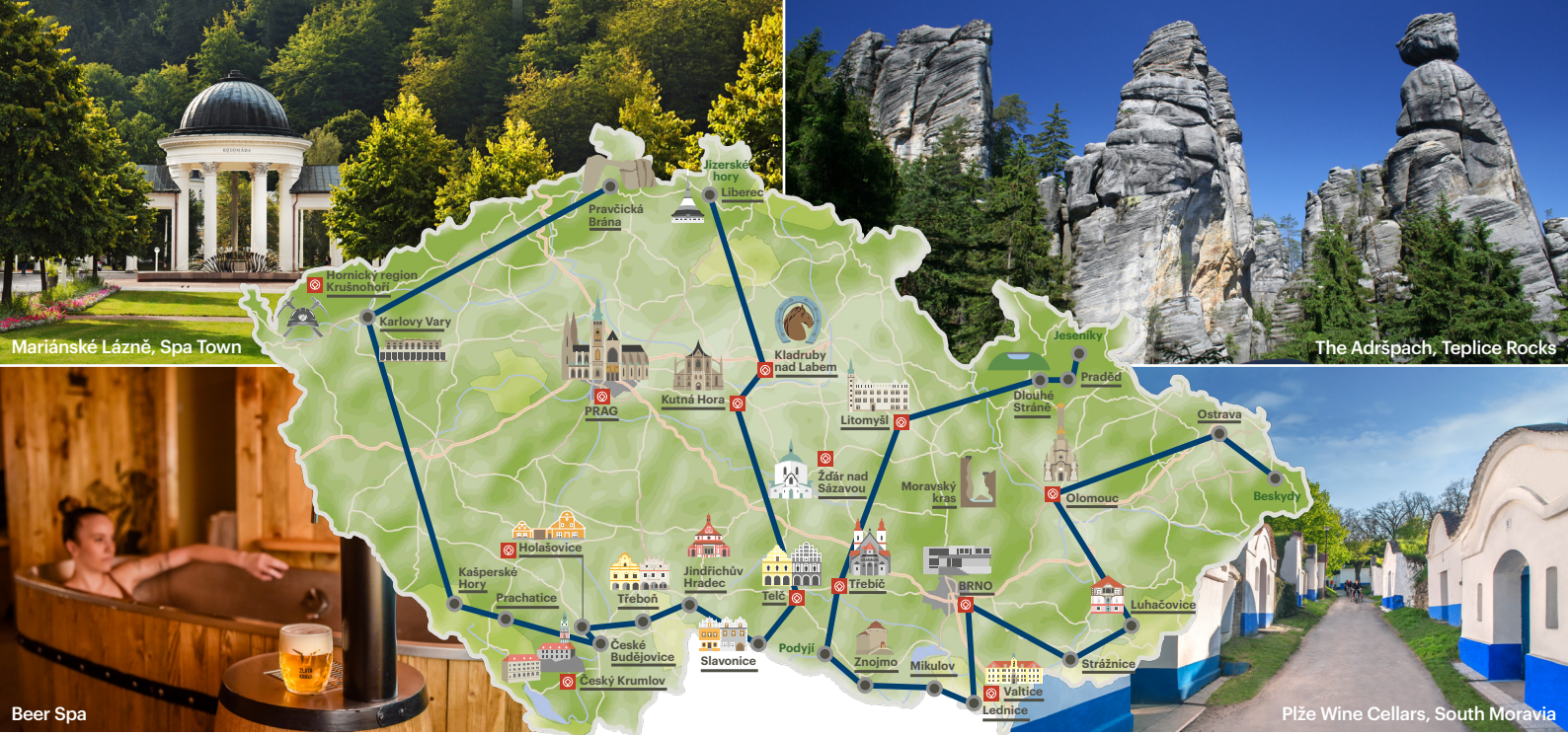
Mariánské Lázně, Spa Town