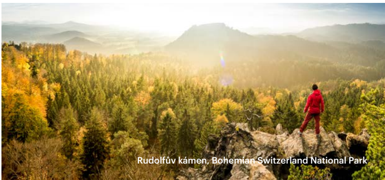
Rudolfův kámen, Bohemian Switzerland National Park