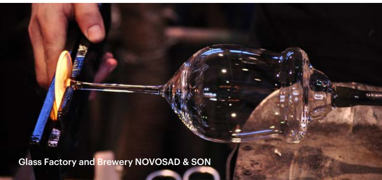
Glass Factory and Brewery NOVOSAD & SON