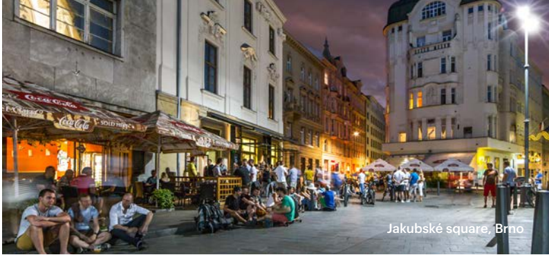
Jakubské square, Brno